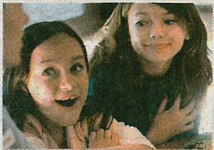
Read Across America News, Page 3